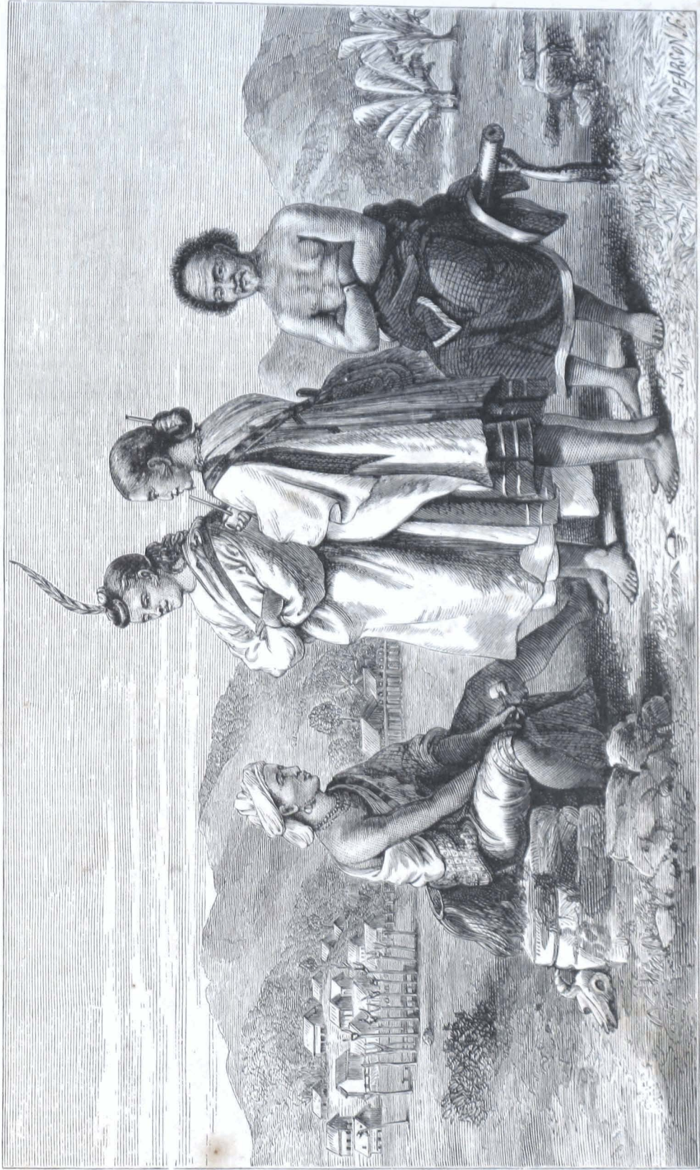
A GROUP: LUSHAI—FOI—LUSHAI—SOKTÉ.